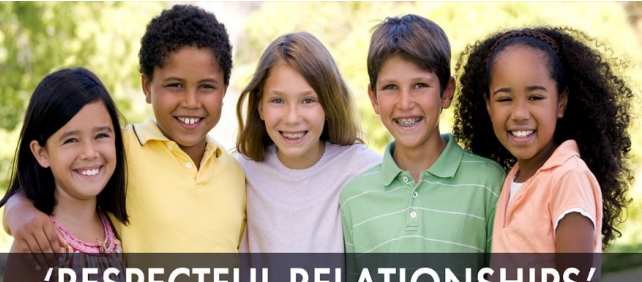
'RESPECTFUL RELATIONSHIPS' Education Queensland

Commencing 13th February. Concludes 20th March.