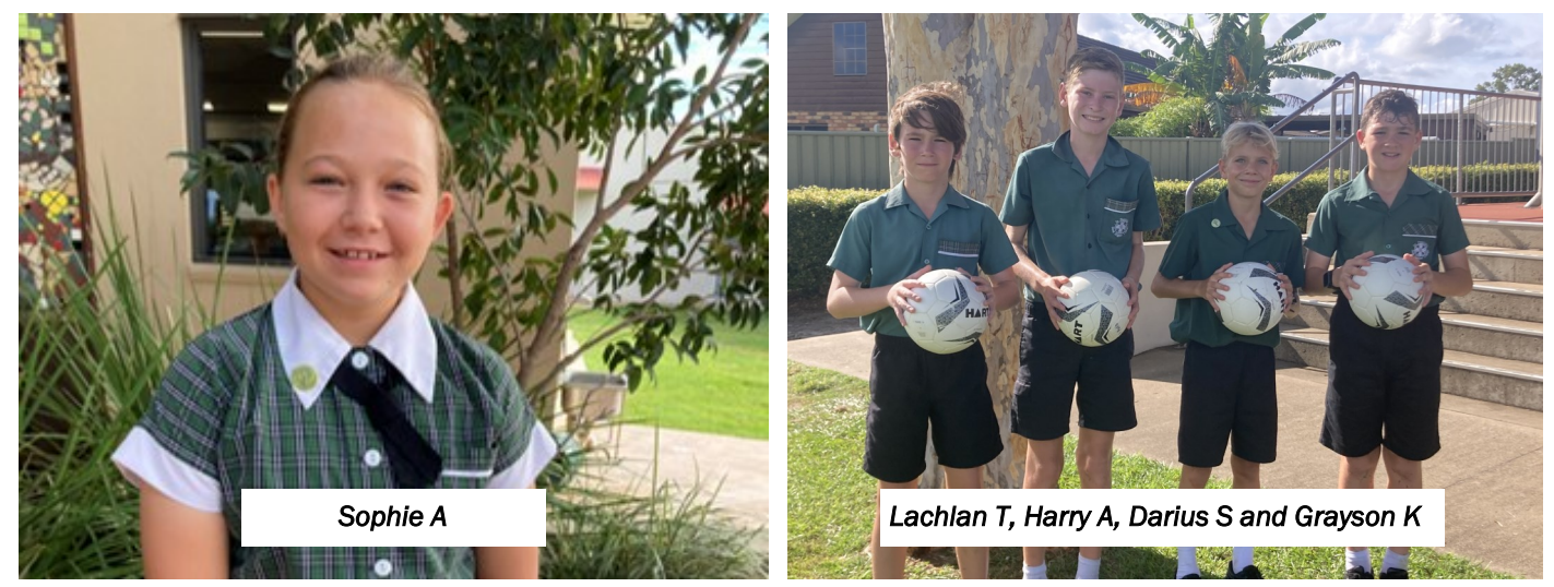
10-12 Years Football