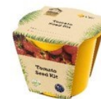
Tomato seed kit